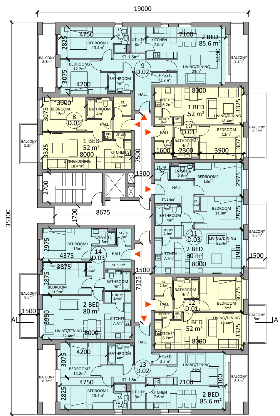
First Floor Plan scale 1:200